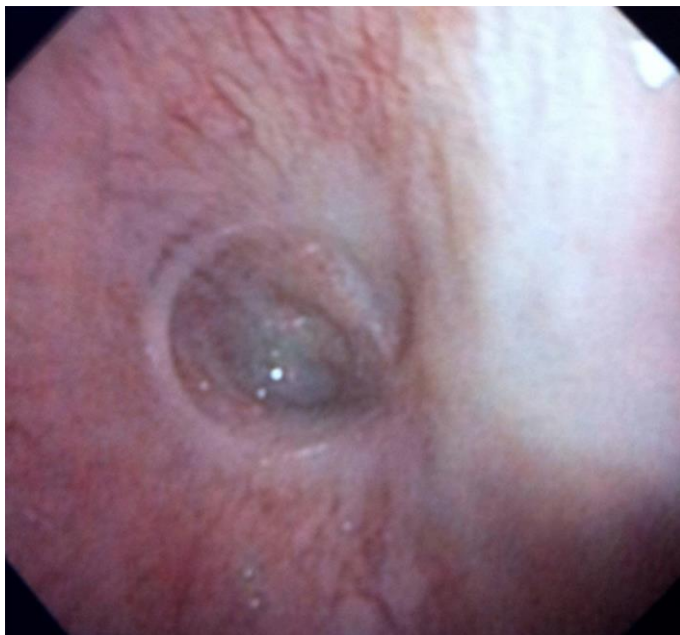
Fig. 2. Endoscopic view of the complete PES.