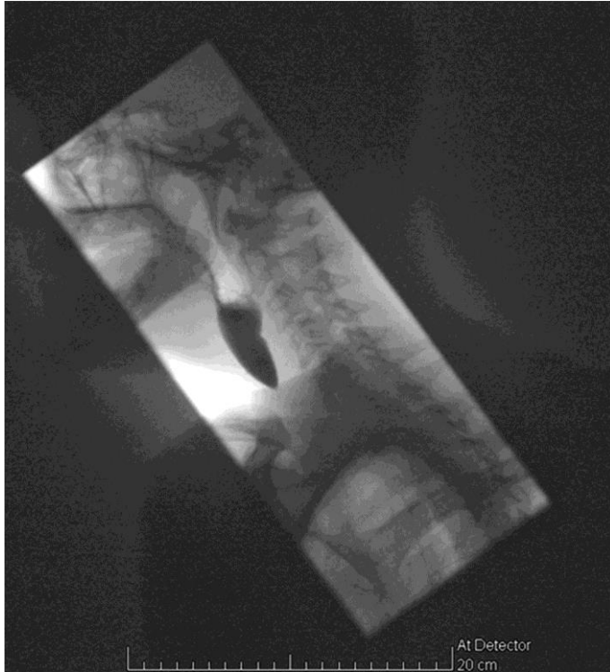
Fig. 1. Videofluoroscopy showing the complete PES.