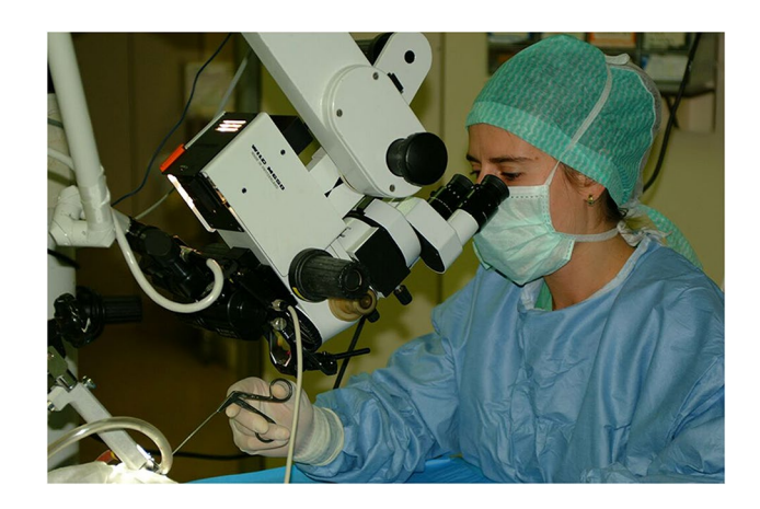
Fig. 1 CO<sub>2</sub> Transoral laser microsurgery or CO<sub>2</sub> TOLMS