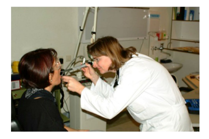
Fig. 2 CO<sub>2</sub> Transoral laser surgery or CO<sub>2</sub> TOLS